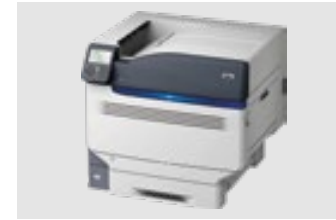
OKI PRO9541WT MAX: DIN A3XL/12.5x19"