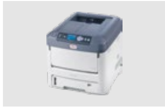
OKI PRO7411WT ES7411WT/C711WT MAX: DIN A4XL/8.5x17"