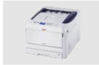
CRIO 8432WDT* OKI PRO8432WT MAX: DIN A3XL/11.8x19" *CRIO IS ONLY AVAILABLE IN NORTH & SOUTH AMERICA