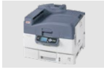
OKI PRO920WT ES9420WT/C920WT MAX: DIN A3XL/12.5x19"