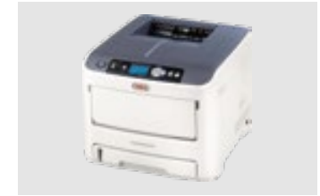
OKI PRO6410 NEON MAX: DIN A4XL/8.5x17"